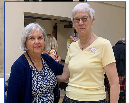
Orange County Ceilidh