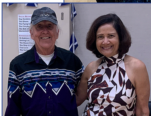
Orange County Ceilidh