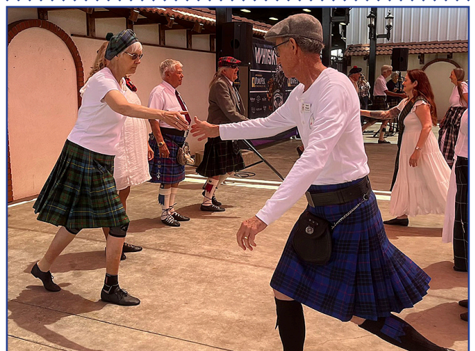
Orange County Ceilidh