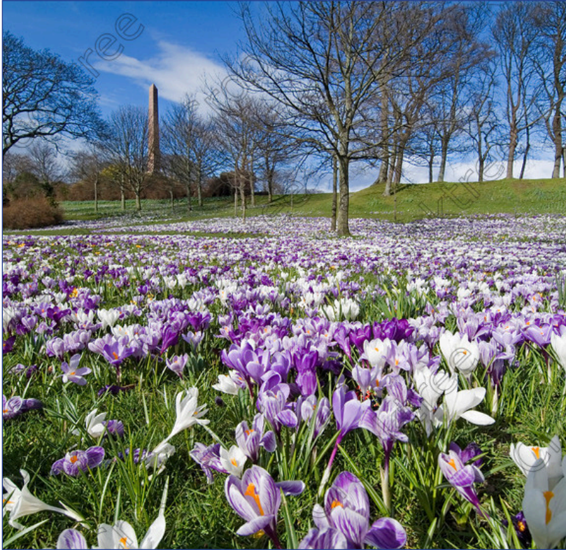
February crocuses in Aberdeen's Duthie Park (In the background is the McGrigor Obelisk.)