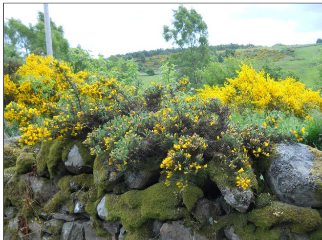
June broom in Scotland

Royal Scottish Country Dance Society Los Angeles Branch