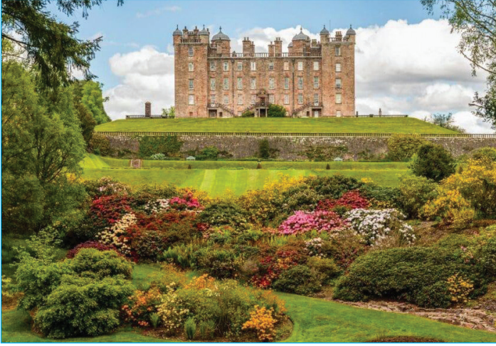
June bloom at Drumlanrig Castle near Thornhill

Royal Scottish Country Dance Society Los Angeles Branch